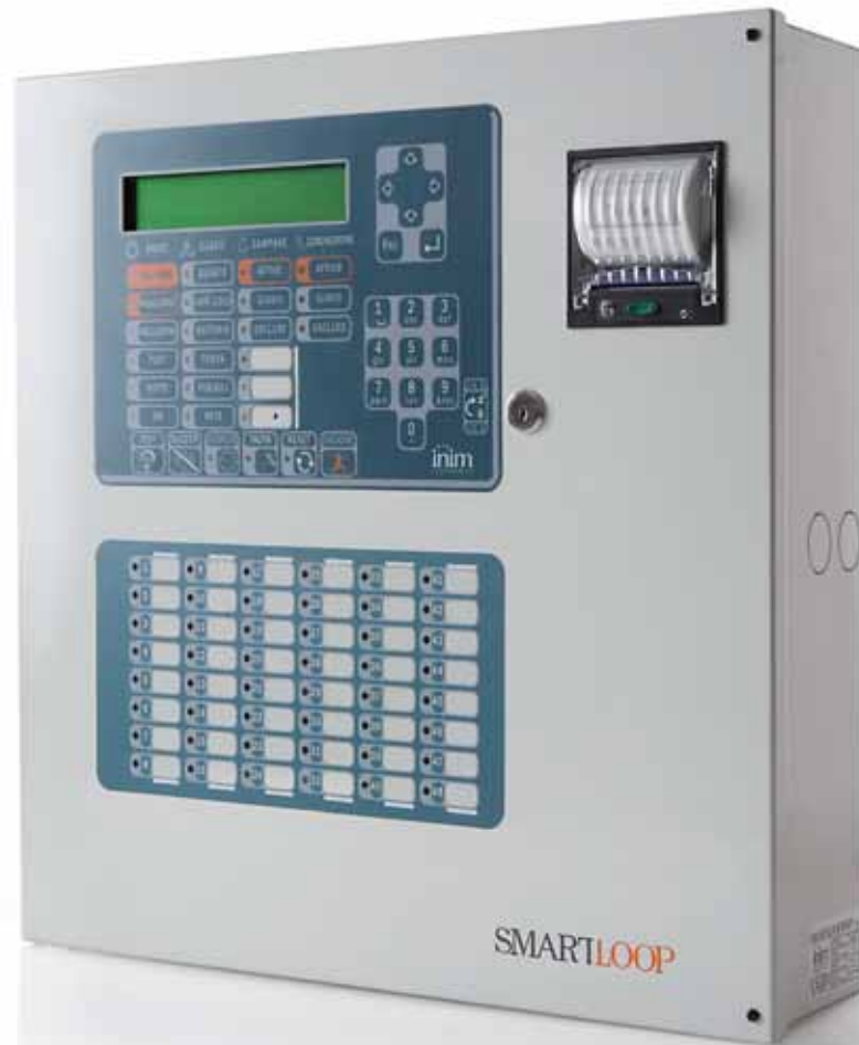
SmartLoop Analogue fire alarm control panel User's manual

0051 0051-CPR-0225 0051-CPR-0226 0051-CPR-0227 0051-CPR-0228 0051-CPR-0231 0051-CPR-0232