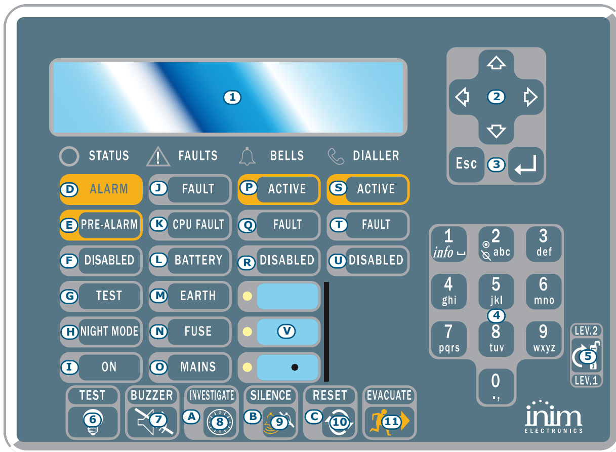
Figure 1 - Control panel frontplate

The SmartLoop control panel manages up to 15 consoles, the main console is located on the control panel frontplate ("G" and "P" models only), and up to 14 optional consoles (SmartLetUSee/LCD repeaters connectable to RS485 BUS).